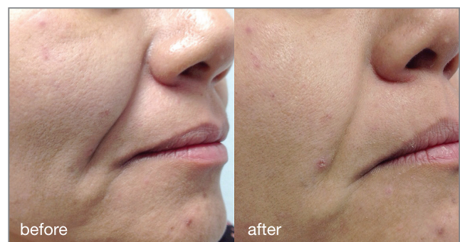
Fotona4D® procedure: courtesy of Adrian Gaspar, MD

A light cold Er:YAG ablation that gives a pearl finish to the skin. SupErificial™ additionally improves the appearance of the skin and reduces imperfections by using propriety VSP technology, enabling the operator to easily adjust the laser to an extremely controlled light peel, without thermal effects, for a no-down time, precise treatment.